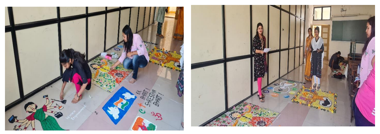
Students making Rangoli during the competition.

3. Non –technical competition of Drawing and Rangoli were conducted to develop art skills among female students, which can help them in future. An invited renowned women leader addressed these girls to inspire them for non- technical skills. This event helps us to reach society as women. The main motto of the competition is to make students fearless and enterprising and also improve their skills. Cash Prizes were awarded to first two winners to motivate the girls.30 girls from the various programs participated in the events.