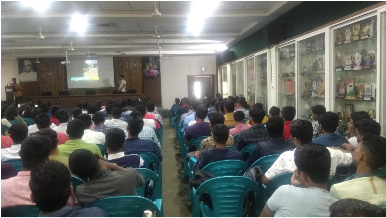
Session on Universal Human Values