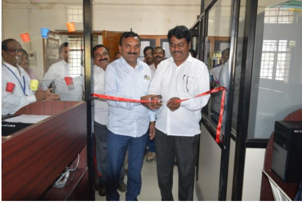
Photo No. 01: Inauguration program of Vaastu 2020 at Civil Engg. Dept.

On Monday, 2 nd March, 2020, Time: 10.00 pm -5.00 pm, Venue: Civil Engineering Department.