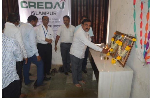
Photo No. 02: Inauguration program of Vaastu 2020 at Civil Engg. Dept.