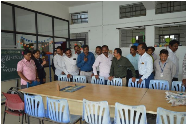
Photo No. 03: Visit of Chief Guest Er. P. R. Patil to various events of "Vaastu 2020" in Civil Engg. Dept.