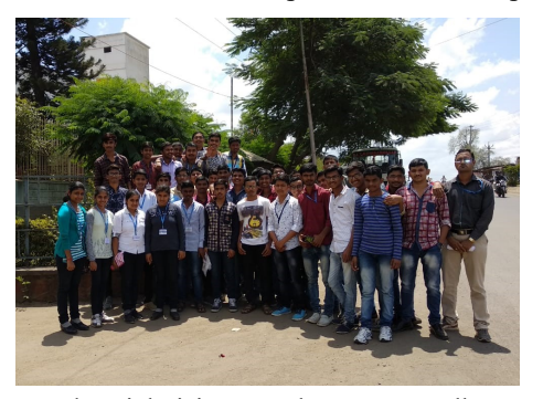
Industrial visit to Rocket Engg, Kolhapur