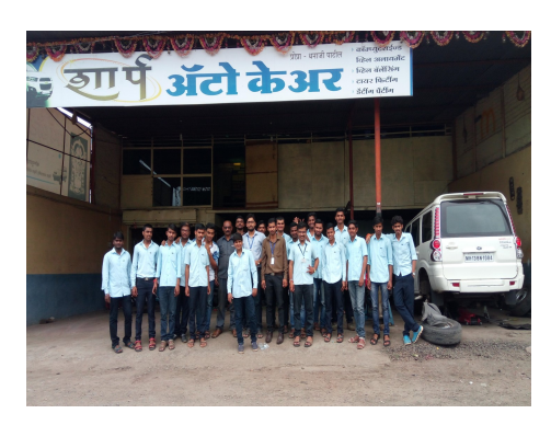
Industrial visit to Sharp Auto Care, Islampur